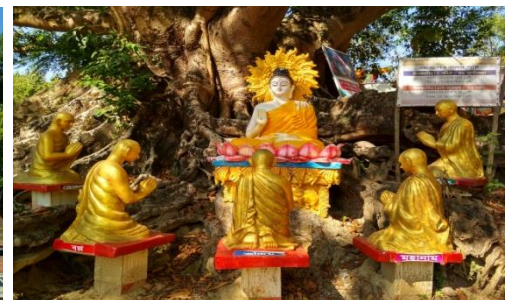
2300 years Rangkut Buddha Bihar