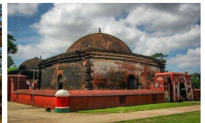
Tomb Of Saint Khan Jahan Ali