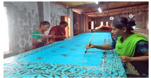
Silk Mill factory