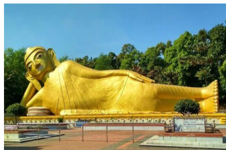
100 feet buddha statue