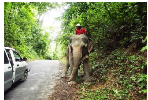
Lawachara rain forest