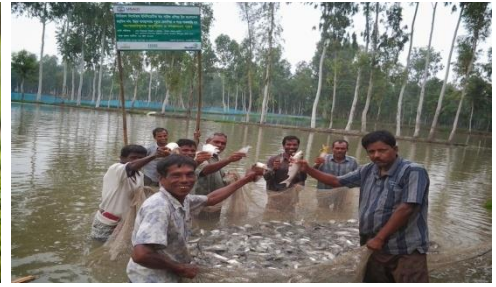
catching fish by net