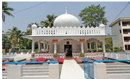
shrine of Lalon Shah