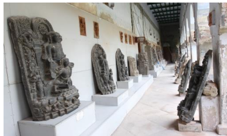
Varendra research museum