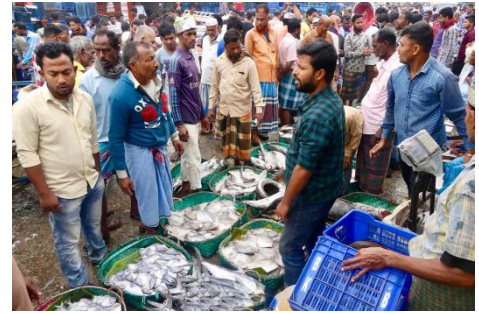
old fish market