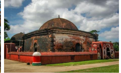
Tomb Of Saint Khan Jahan Ali