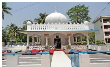
shrine of Lalon Shah