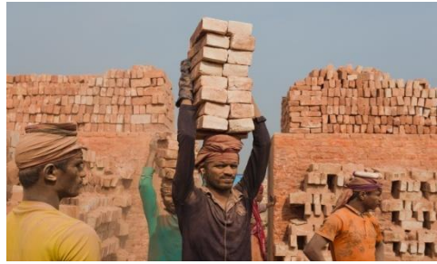
visit red brick field