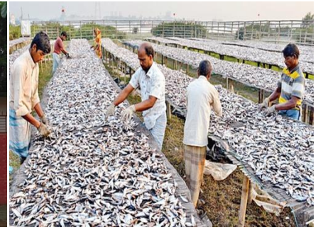
Dry fish market