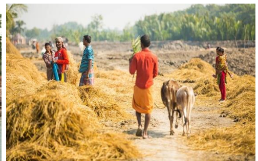
Dhangmari local village