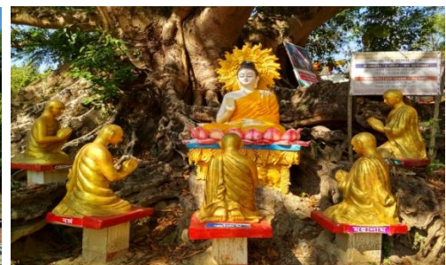
2300 years Rangkut Buddha Bihar