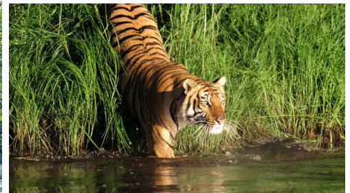
enjoying wild life