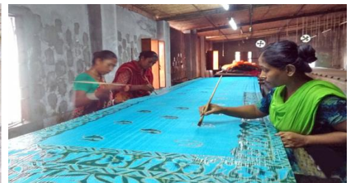
Silk Mill factory