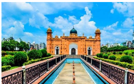
Lalbagh Mughal fort