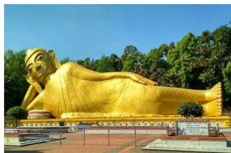
100 feet buddha statue